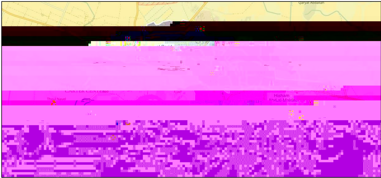
Figure 2 - Frontlines around Raqqa city by July 5

adjacent to the city center, where most of the ISIS forces defending Raqqa are located.