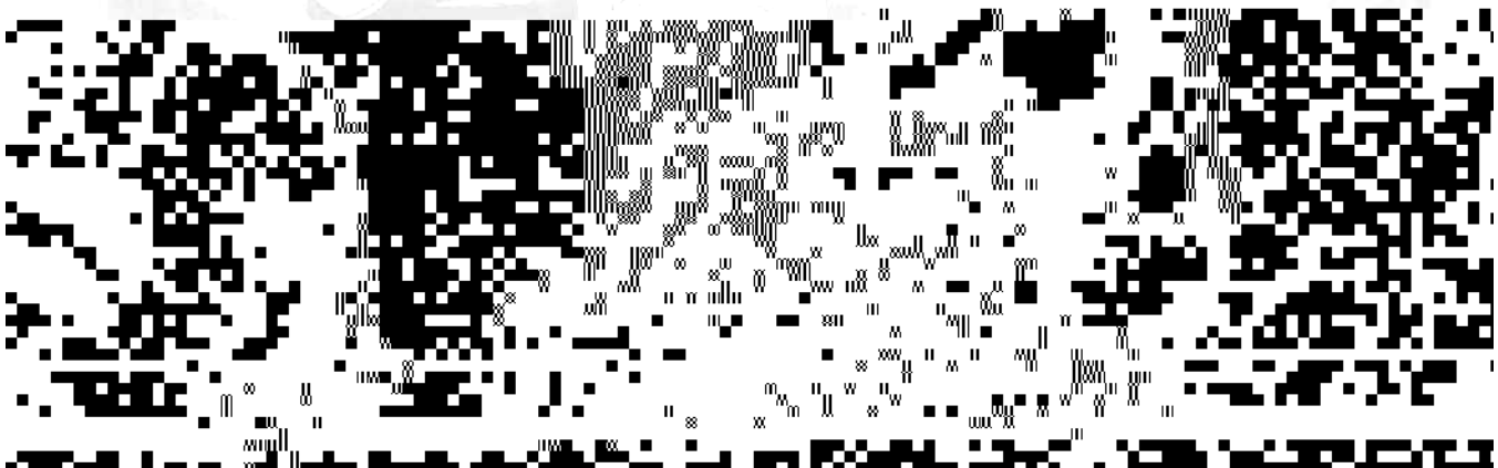
Polling staff work by lantern light to finish counting votes.