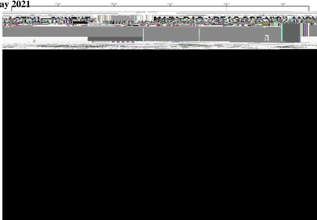
Figure 3 Cunene Active surveillance areas and rumors detected, Cunene Province, Angola, May 2021