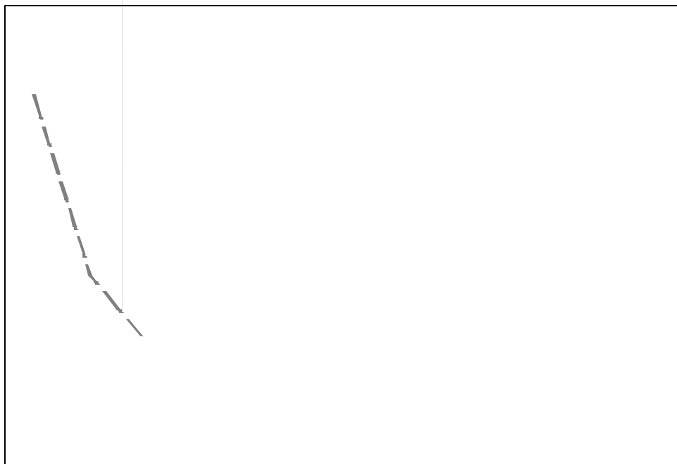
Monthly Distribution of Cases of Dracunculiasis Reported in Nigeria During 2002 – 2004*